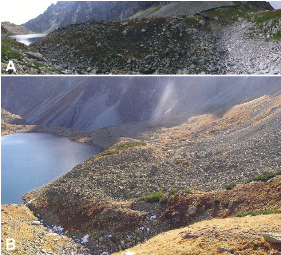
Fig. 2. Relict rock glacier body at the Malé Hincovo pleso (Mengusovska Valley, High Tatra Mountains, Slovakia). A-massive, convex frontal slope, B-collapsed blocky surface of relict rock glacier located above the presumed lower limit of contemporary permafrost (1930 m a.s.l.).

also made by A. Kotarba (1986, 1991–1992, 2007) who examined problems associated with the proper identification and classification of relict debris landforms in the Tatras. He defined a pure rock glaciers as only those associated with the flexible creeping of debris together held by interstitial ice, which form under permafrost conditions and without any contribution from glacier ice. A cartographic analysis of the occurrence of rock glaciers was produced using field data and LiDAR laser scanning data collected in selected valleys in the Polish and Slovak parts of the Tatras by P. Kłapyta (2015) and J. Zasadni (2015). A recent paper also covers results of identification efforts focused on rock glaciers located throughout the Tatras based primarily on the analysis of digital satellite data (Mareková 2013; Uxa, Miča 2017b).