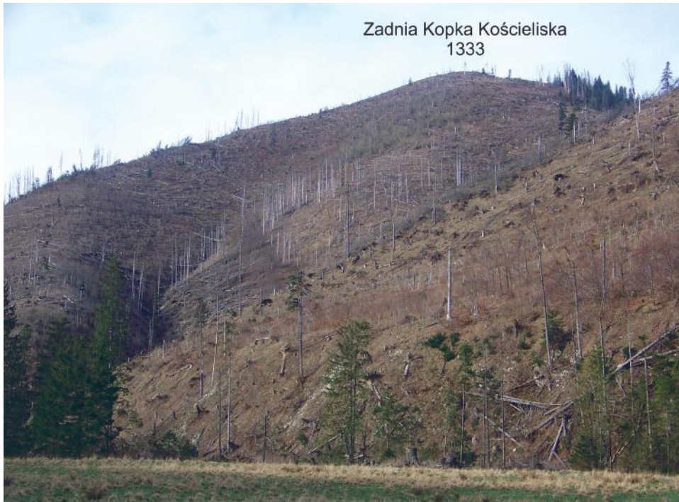
Fig. 4. The geomorphological impact of tree uprooting after a foehn wind occurrence, in December 2013 in Kościeliska Valley, Western Tatra Mountains (photo taken in April 2018).

trees. Events of this type may also trigger and transport large amounts of weathering material (Kotarba 1970, 1992; Rojan 2010).