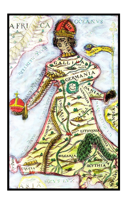
Warsaw , 18-20 October 2017